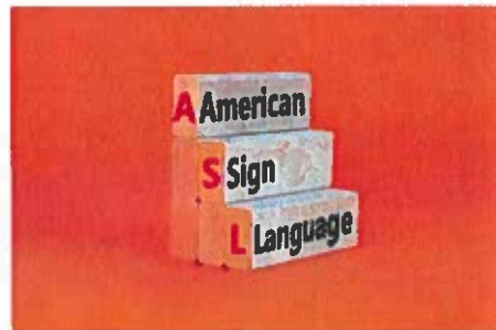
American Sign Language I Starts Jan. 30 Course Fee $125