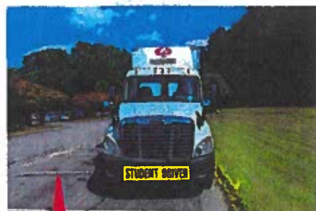
Truck Driver Training Starts March 20 *Course Fee $180