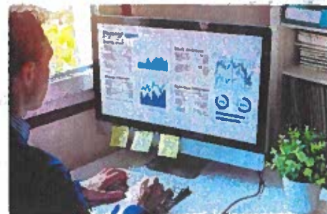
Introduction to Quickbooks Starts Feb. 6 (Online) Course Fee $70