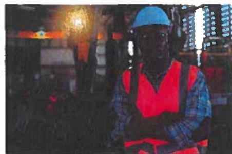
Forklift Operator Training Feb. 25 (One-Day) Course Fee $70