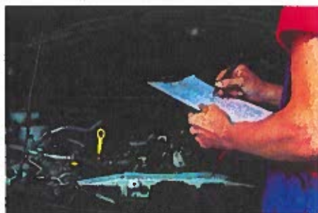
Vehicle Safety Inspection Starts Feb. 21 Course Fee $70