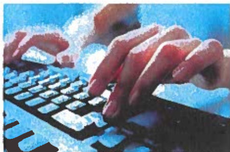
Income Maintenance Caseworker I Starts Feb. 6 Course Fee $125