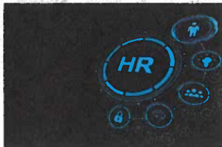
Human Resource Management Starts Feb. 6 (Online) Course Fee $70