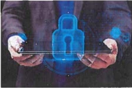
Cybersecurity Training Starts Jan. 21 *Course Fee $180