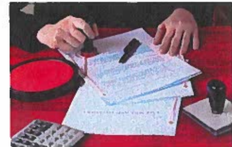
One-Day Notary Public Feb. 4 (One-Day) Course Fee $70

*Additional fees may apply for these classes.