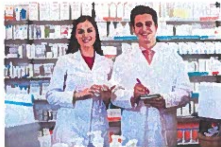
Pharmacy Tech I Starts Jan. 23 *Course Fee $180