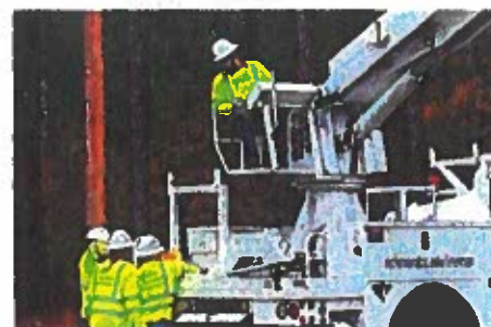
Electric Lineworker Starts May 1 *Course Fee $180

*Additional fees may apply for these classes.