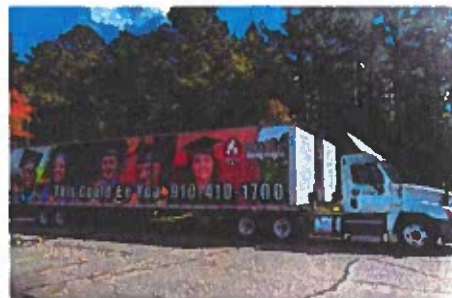
Behind The Wheel Training Starts Feb. 13 *Course Fee $180