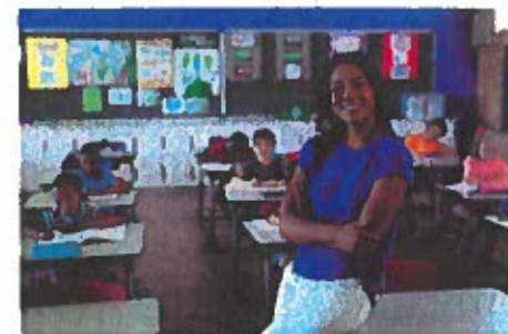
Effective Teacher Training Starts March 6 (Online) Course Fee $70