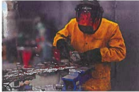
Basic Welding Starts Jan. 23 Course Fee $180