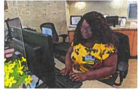
Medical Office Admin. Assistant Starts Jan. 23 (Online) Course Fee $180