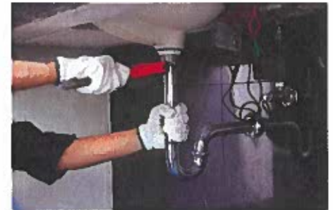
NCCER Plumbing Level I Starts Jan. 24 *Course Fee $180