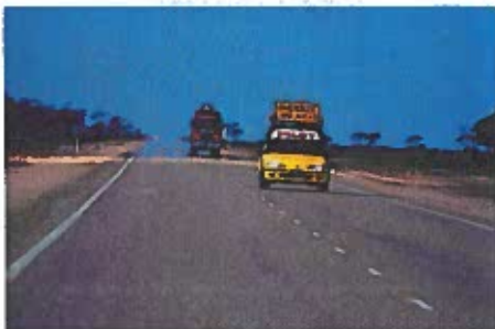
Pilot (Escort) Vehicle Operator Jan. 27 (One-Day) Course Fee $70