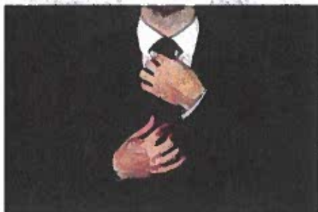
Admin. Professional Training Starts Feb. 6 (Online) Course Fee $70