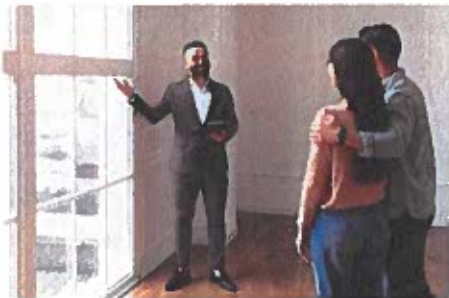
Real Estate Broker Pre-Licensing Starts Jan. 23 Course Fee $180